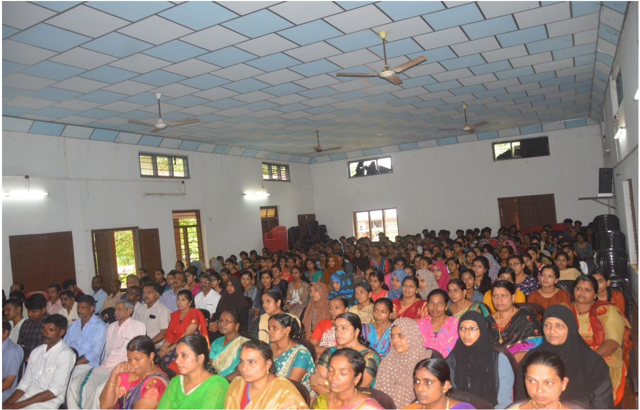
Practice 2-Convergence-Multidisciplinary seminar series